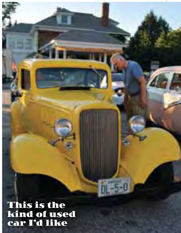
This is the kind of used car I’d like

Any club member will answer questions — they are extremely knowledgeable and love to talk about their cars. If you have a few dollars in your pocket, treat the family to food at the Sunapee Lions Club booth or an ice cream at the Lil’ Red Baron ice cream stand. The Car Nutz season runs from May to September. >>>>