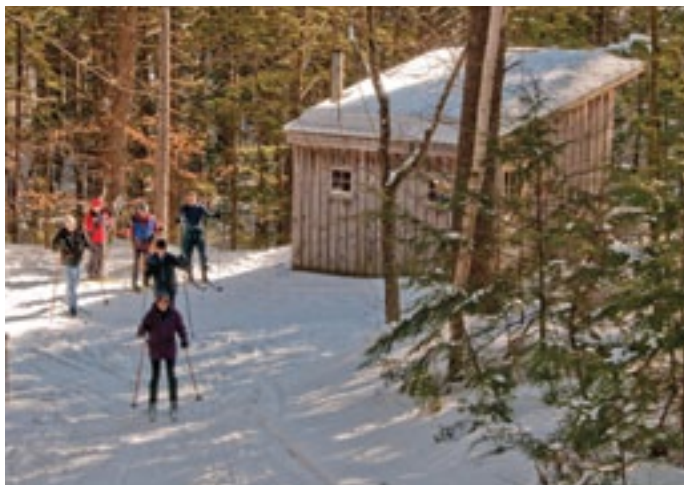
Skiers leave Robb’s Hut for the Pine Hill Ski Club trails.

The trails are un-groomed and somewhat “free form,” but that’s part of the appeal of this sport which is growing in popularity out West. Whaleback will be holding races this season for serious competitors who don’t mind taking a full lap around the mountain — snowshoeing up and running down or skiing up and skiing